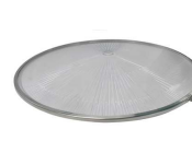
PC Bottom Reflector