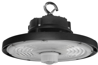
Optional Motion Sensor

The new generation of LED high bay light adopts the appearance of UFO, which makes it more futuristic, longer lifespan, lower maintenance and higher efficiency. Replace less-efficient traditional metal halide bulb output. Slim body, light-weight no bulky heat sink, LED high bay light can also work with 0-10V dimmer, brightness is adjustable as your desire. Preinstalled hook make it easy for a fast installation and come with an alternative sturdy U-bracket to mount the LED high bay light to wall or ceiling and adjust it to achieve expected emitting angle. It's simple to replace existing lights or make a new installation. The LED high bay light is ideal for commercial or industrial lighting, such as warehouses, factories, gyms, supermarkets, stadiums, retail spaces, workshops, industrial areas, garages, etc.