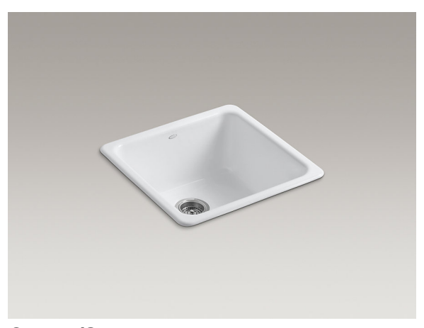
Codes/Standards ASME A112.19.1/CSA B45.2