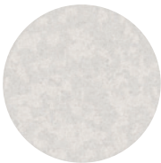
6" Diameter Pressure-sensitive Sanding Disc