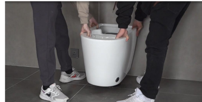
11.Move the toilet to the location where it will be installed