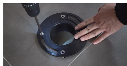
5.Put the flange ring into the drain outlet and install it