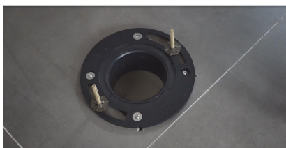
6.Install two long screws as below picture