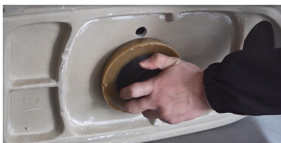
9.Turn over the toilet bowl and install the flange ring as below picture