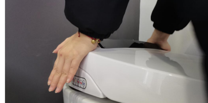
14.Press the cover down slightly harder