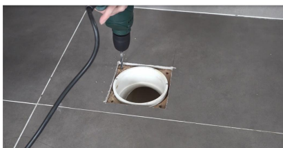
3.Take off the flange ring and drill four holes for screws