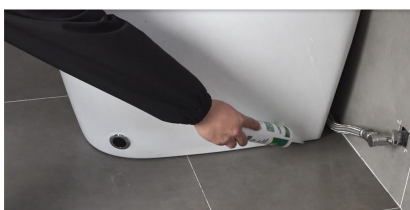
15.Apply some glass glue to fix the toilet and insulate the outside dirt from entering. (The glass adhesive in the picture needs to be purchased by oneself.)