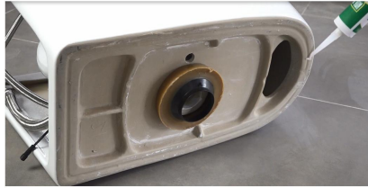
10.Apply some glass glue on the bottom of the toilet (The glass adhesive in the picture needs to be purchased by oneself.)