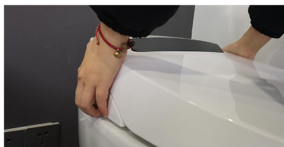
7.Raise the toilet seat.