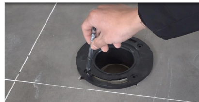
2.Put the flange ring into the drain outlet and mark the screws positions