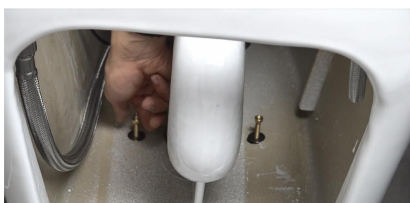
12.Make sure two holes in the bottom of the toilet align with the two long screws in the flange ring,then install it