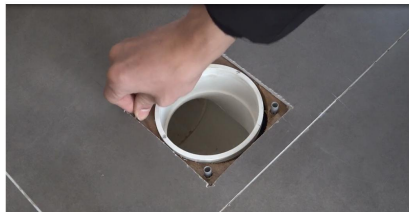
4.Put the screws into the holes