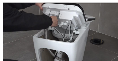
8.Take off the whole toilet seat and unscrew the flexible tube and black wire