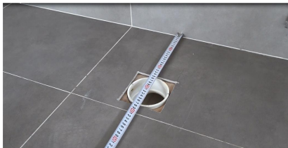
1.The confirmation of the installation environment, The measurement distance is 300mm or greater