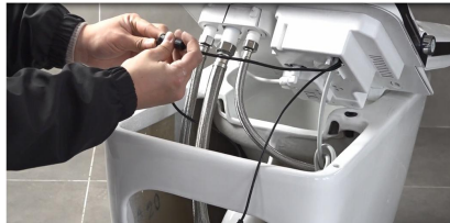
13.Put the toilet seat in the toilet and reconnecting the flexible tube and black wire